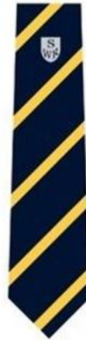
Year 10- Yellow