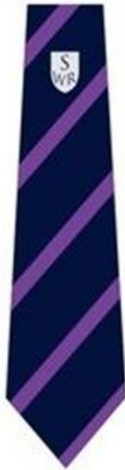
Year 7- Purple

As part of this Uniform Dress Code and to help create a sense of community spirit within the year group, Years 7, 8, 9 & 10 have a colour tie, with a coloured stripe allocated to the year group, these ties will progress with the student as they move through the school. Year 11 will stay with their Blue and Silver ties.