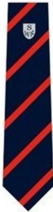
Year 8- Red