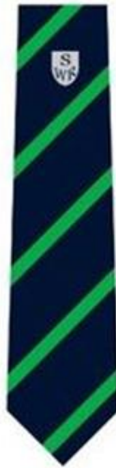
Year 9- Green