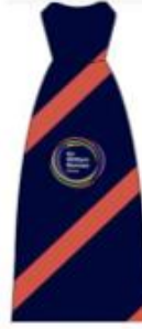
Year 10 Tie 2022/2023